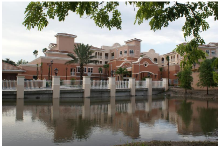
Front View of Main Entrance