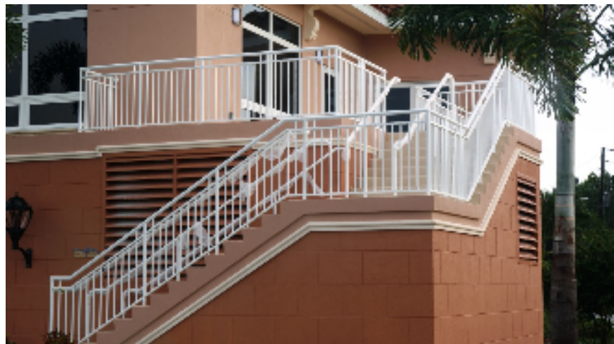
Back View of Facility